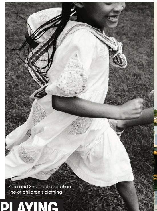
Zara and Sea's collaboration line of children's clothing